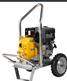
VAR 4-100 B TROLLEY - R