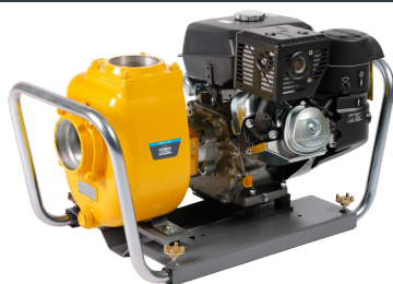
VAR 4-100 B LIFT - R